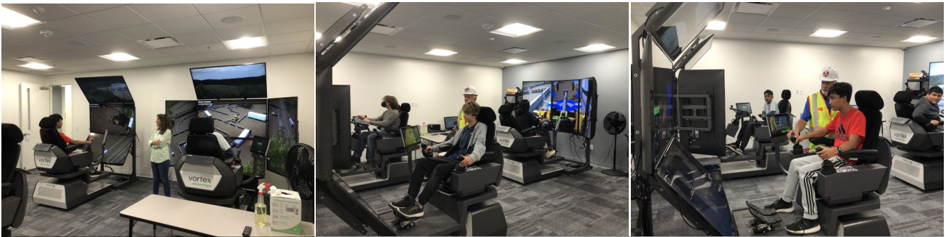
The PHS students took to the construction equipment training simulators like ducks to water!

If you would like to take a 'virtual tour' of AGC's amazing Training Center , type 'Ctrl' and 'Click' on this Training Center link.