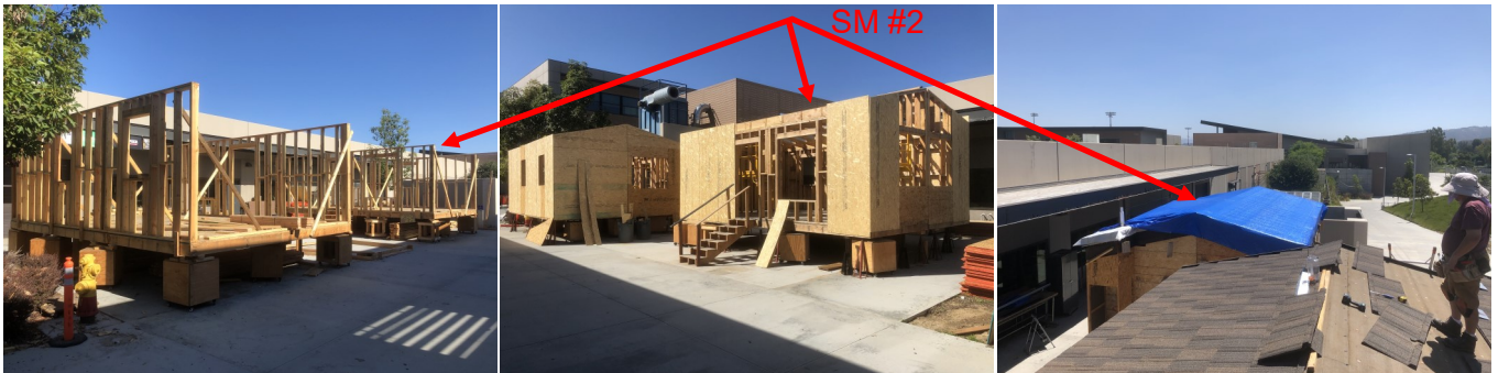
SM #1 and its twin, SM #2, in December 2019, March 2020 and July 2020.

Our plan was to have a new class of building students complete the second cottage during the 2021-2022 academic year. Construction of our cottages was conceived as a capstone project for students with at least a year of building experience under their tool belts. With the campus shut down, no students acquired building skills in the last year. Hence, this year was expected to be a rebuilding year for the building program at SMHS. But, SMHS is not offering a building class this year. Without a class of construction students, we will have to be creative to complete SM #2. We will get it done!