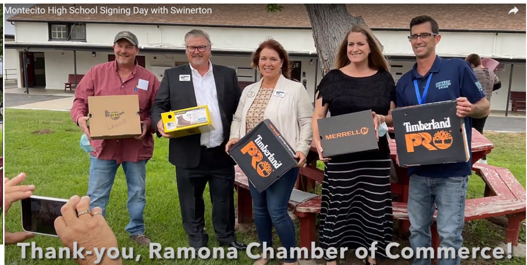
Thank-you, Ramona Chamber of Commerce!